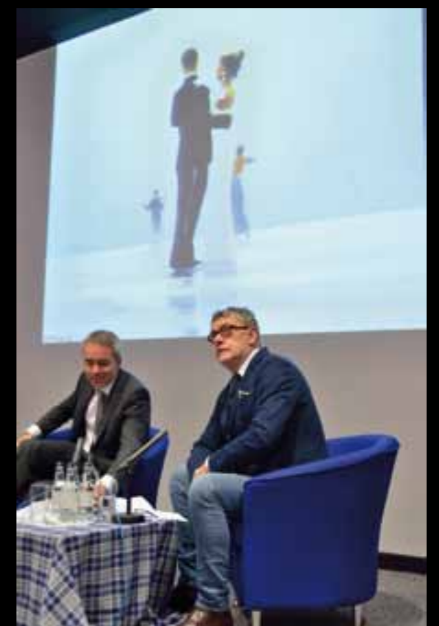
Jack talks to a packed audience at QMU.

Over 100 of Jack Vettriano's paintings were recently on show at Kelvingrove Art Gallery, Glasgow. The exhibition, which included many works that have not been seen for more than 20 years, was his most comprehensive show ever. □