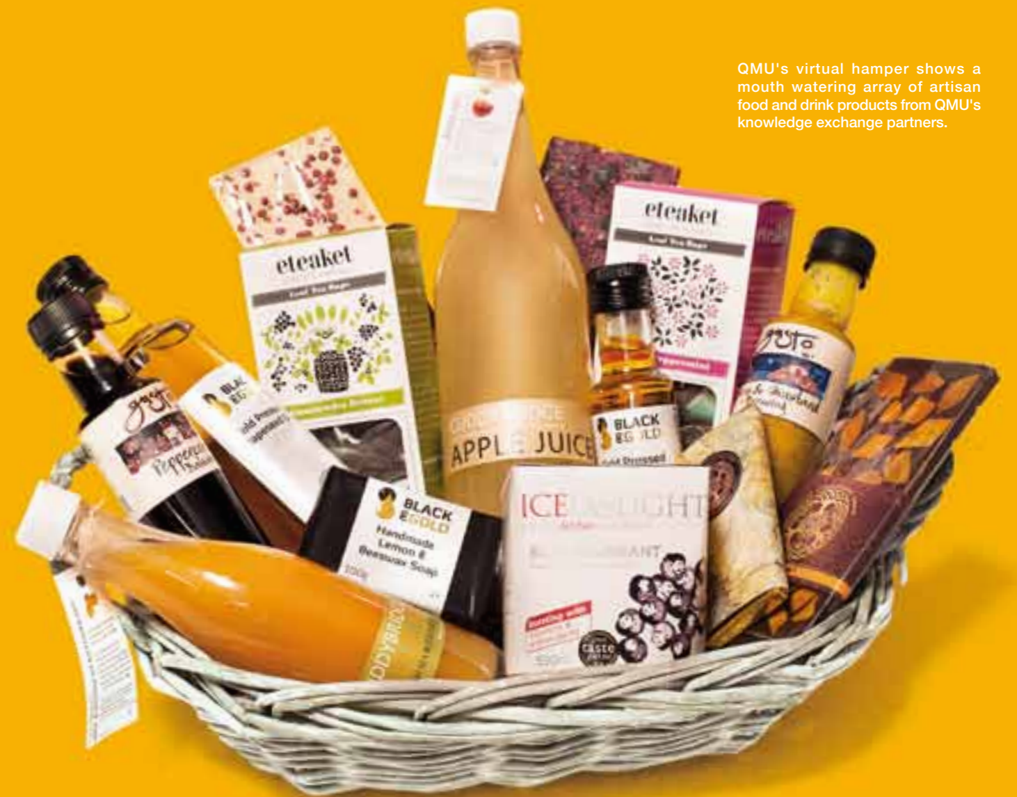
QMU's virtual hamper shows a mouth watering array of artisan food and drink products from QMU's knowledge exchange partners.

Producer results: acquiring the true nutritional knowledge has allowed Black and Gold to confidently provide accurate product information for marketing statements and new investors.