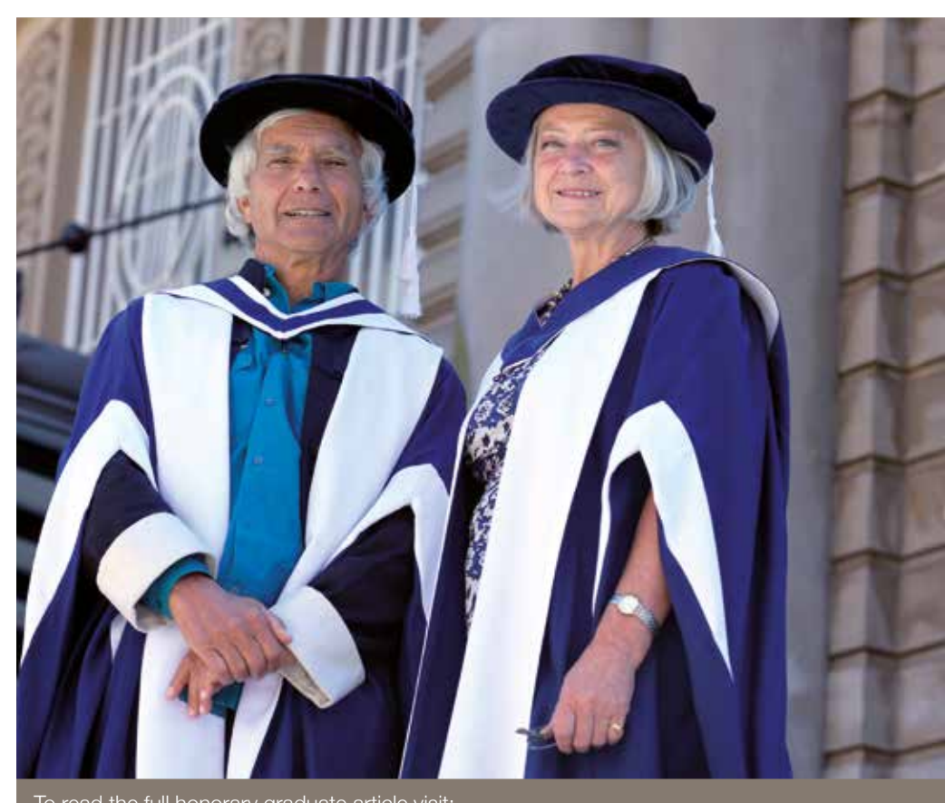
To read the full honorary graduate article visit: www.qmu.ac.uk/marketing/press_releases/Honorary-graduates-2014.htm